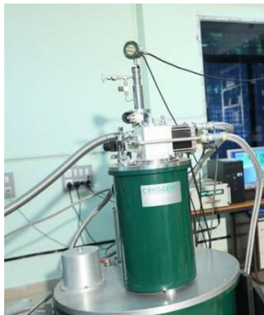
(left) Cryogen free 10T superconducting magnet with 2K variable temperature inserts